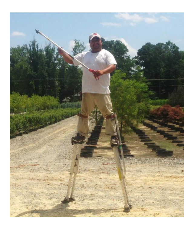
Figure 7. Drywall stilts are a great way to quickly and efficiently prune trees.

Likewise, for pruning larger shrubs and trees, having the worker walk around on drywall stilts is a great way to quickly and efficiently prune (Figure 7).