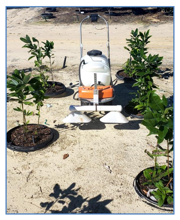
Figure 1. Jacto PJB16 battery powered backpack. Used for watering in granular herbicide applied to pot-n-pot containers.

We took an old riding lawn mower modified the tires and added a pull-behind 40-gallon tank. The idea actually worked but driving in the beds with this piece of equipment was deadly to the trees. Even with a trusted employee using the equipment - we still would run over or scare trees by the dozens. It was just too hard to control. So, we went back to the drawing board and I stumbled across the Jacto PJB16 battery powered backpack (Figure 1).