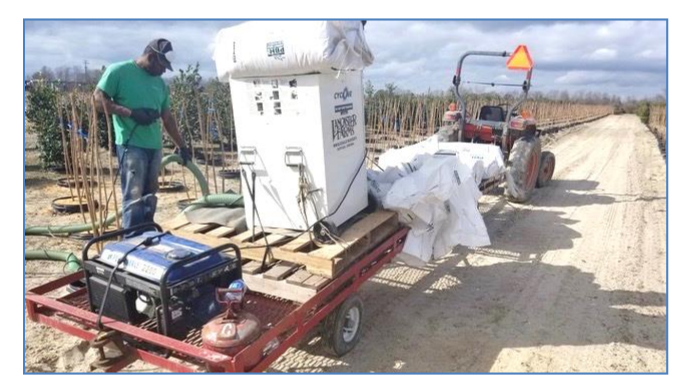
Figure 2. Using an insulation blower to apply rice hulls as a weed barrier to the tops of containers.

So, we started looking for different sized racks - looking at different dimensions to find the rack that worked the best for us! Once we found a rack that was to our liking we realized that we would have to wrap our racks because they had no sides - and plants were falling off during every step of the process. After a spring of hand-wrapping our racks - we knew there had to be a better way! Our loading dock manager found out how other industries were wrapping pallets. The problem was the high cost of the wrapping machines! So as always true to our roots - we started building our own machine - and now have our own for a fraction of the cost (Figure 3)!