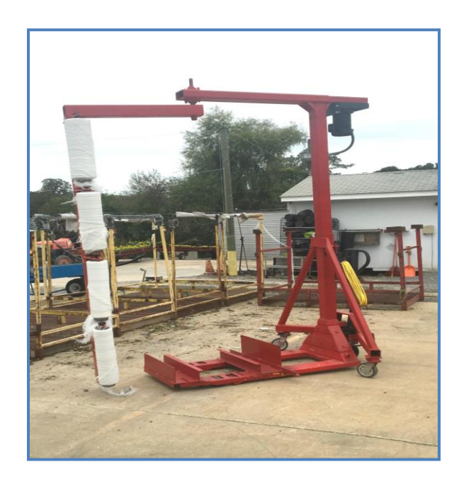
Figure 3. On-site, nursery-built machine for wrapping pallets with plastic to prevent plants from moving and falling during shipping.

Our retail customers are demanding more of us now than ever - and it is just not the quality of our plants that they require. Every year it seems that something else gets added to the list. One of our customers thought that our pots were to dirty and did not like the way they looked sitting on their retail nursery lot. I know it seems stupid; we do all