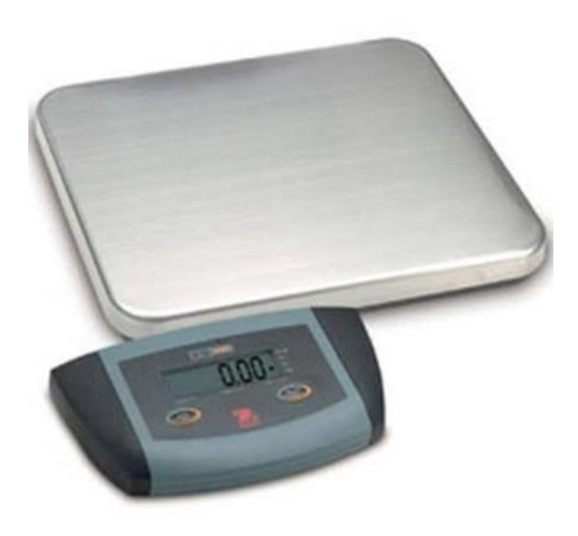
Figure 5. Scales are great for "counting" anything. Rather than counting 50 unrooted cuttings per bundle, propagators can weigh cutting bunches to determine the number of cuttings needed by weight.

Here are some other ideas we also use that are inexpensive and very simple! Scales can be used to "count" everything. For instance, we weigh several bundles of 50 unrooted cuttings held with a rubber band - to get an idea of the "average weight" per 50 unrooted cuttings. With the "average" weight, we can weigh cuttings to reach the approximate cutting numbers neededwithout having to individually count cuttings for making bundles of 50 (Figure 5).